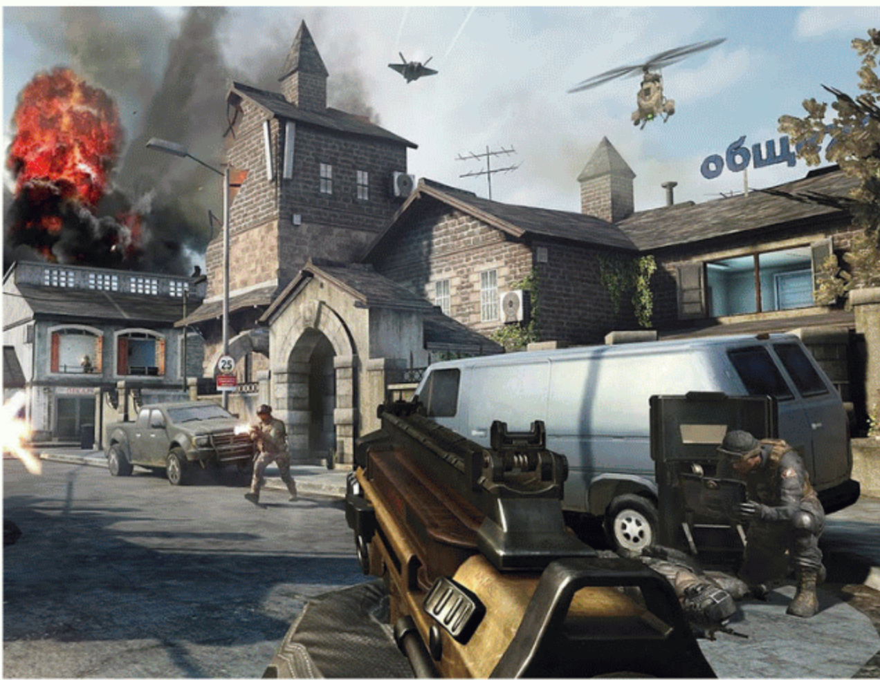
CALL OF DUTY