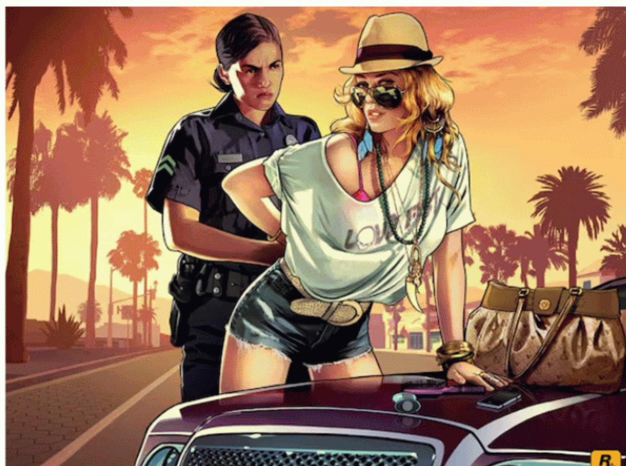
GRAND THEFT AUTO