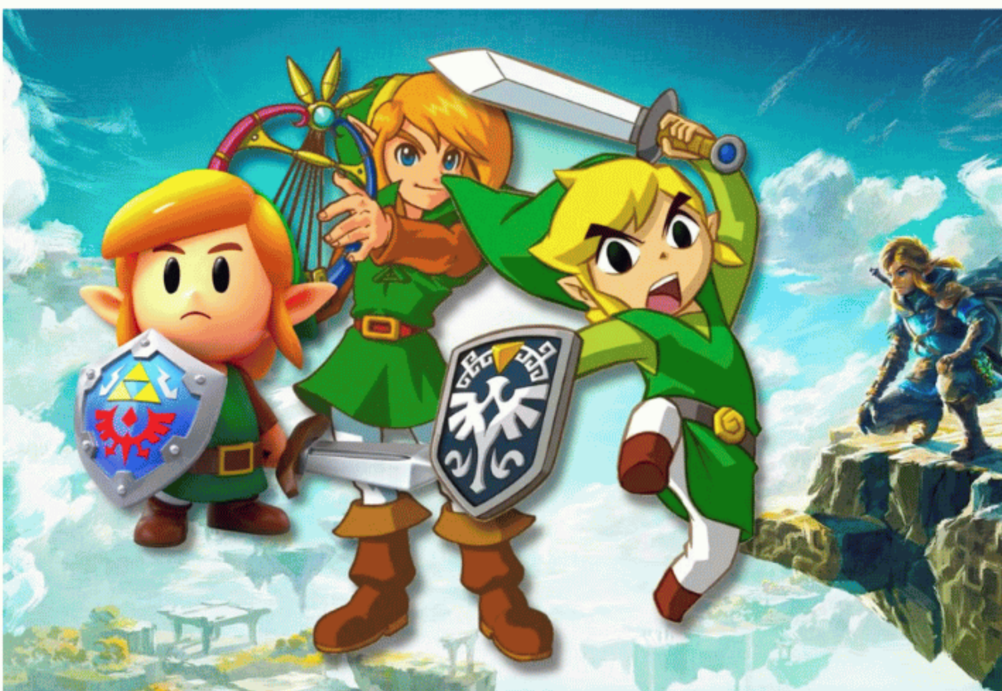
THE LEGEND OF ZELDA