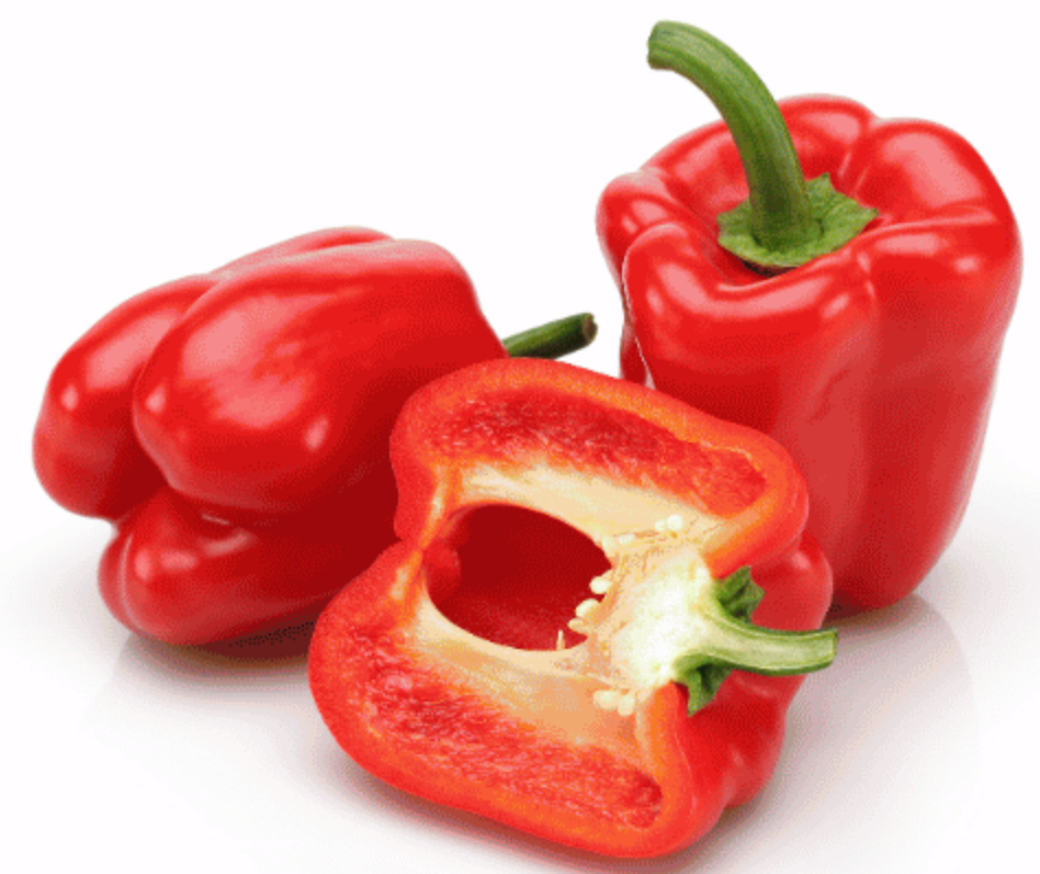
..... BELL PEPPER