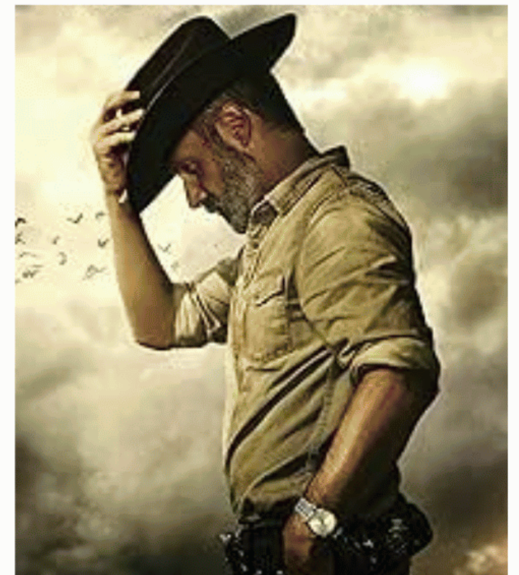
THE WALKING DEAD