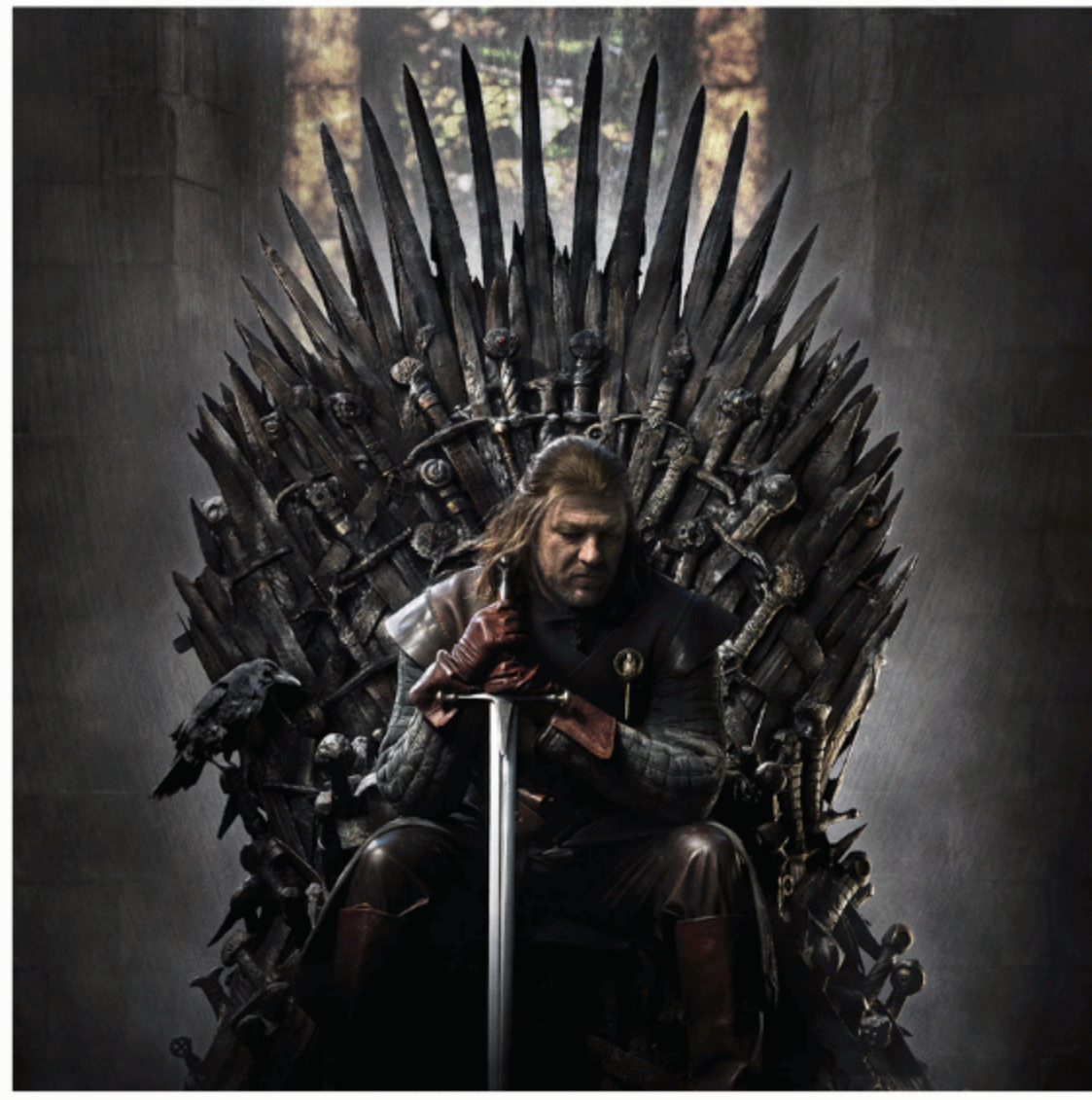
GAME OF THRONES